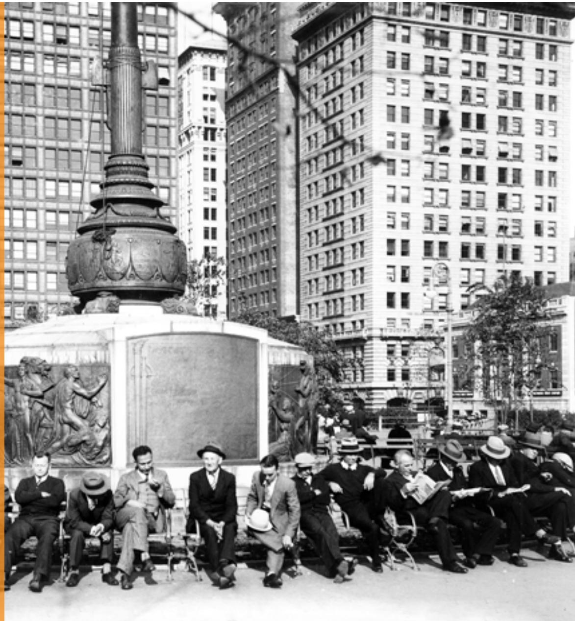
'Men congregate in Washington Square Park, New York City' (Circa 1940)